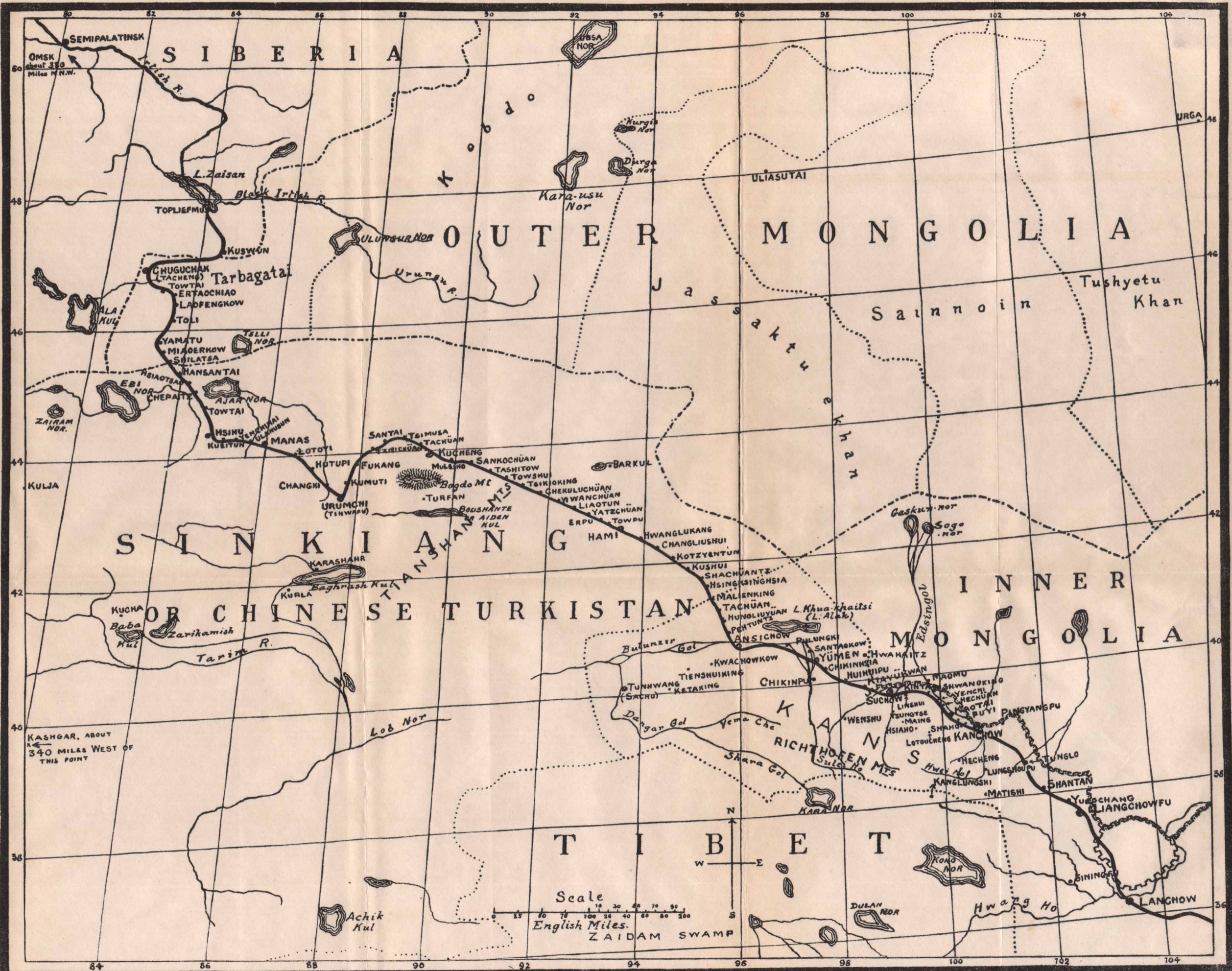
Map of Sinkiang (Chinese Turkistan) marking each oasis on the main trade route across the Gobi Desert. THE HEAVY LINE INDICATES THE ROUTE FOLLOWED BY THE WRITERS